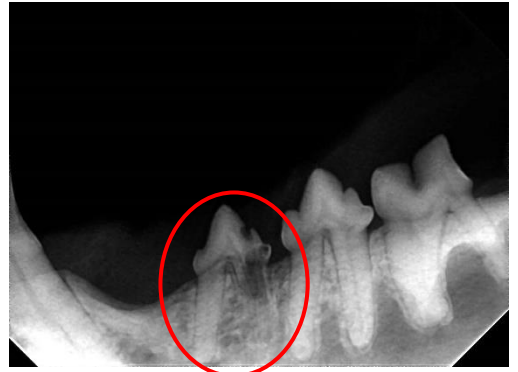
Figure: X-ray of tooth resorption. Notice the lesion at the gumline and the root becoming indistinguishable from the surrounding bone.

The goal we have for our cats is to have a pain-free and functional bite. They are better to have no