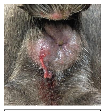
Figure 2: An abscessed and inflamed left anal gland

Mild cases of anal gland sacculitis may be successfully treated with oral anti-inflammatories and antibiotics. Many cases require passing a catheter into the anal gland through the duct so they can be flushed to remove any impacted or infected