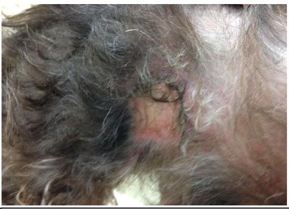
Figure: A "hot spot" is an area of skin that has become itchy and the animal has scratched raw. These often become infected.

Atopy is a diagnosis of rule out. Meaning that we have ruled out all other causes of allergy and itch and are left with environmental allergens. Many pets with environmental allergies also have other types of allergies as well, such as flea allergies and or food allergies. They will often work together to increase the level of itch experienced by the animal.